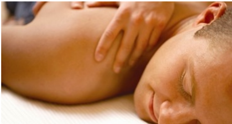
A good massage can sometimes leave you feeling like you had a good workout.

Massage can stimulate the lymph system, which is comprised of several organs